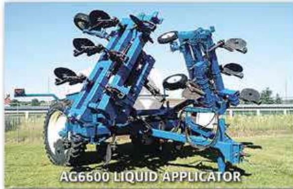
AG6600 LIQUID APPLICATOR