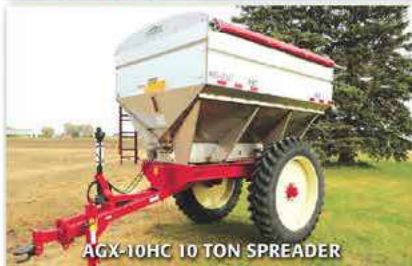
AGX-10HC 10 TON SPREADER