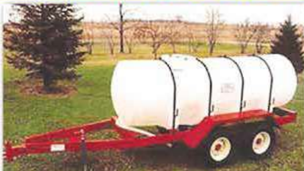
AG1000/1250 CENTER DRAIN NURSE TRAILER