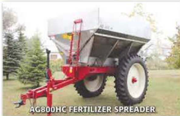
AG800HC FERTILIZER SPREADER