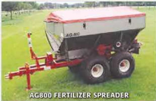
AG800 FERTILIZER SPREADER