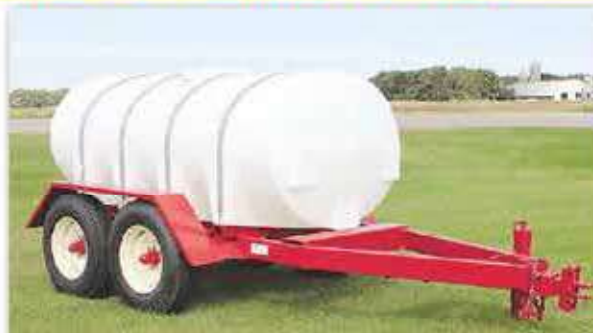
AG116 CENTER DRAIN NURSE TRAILER