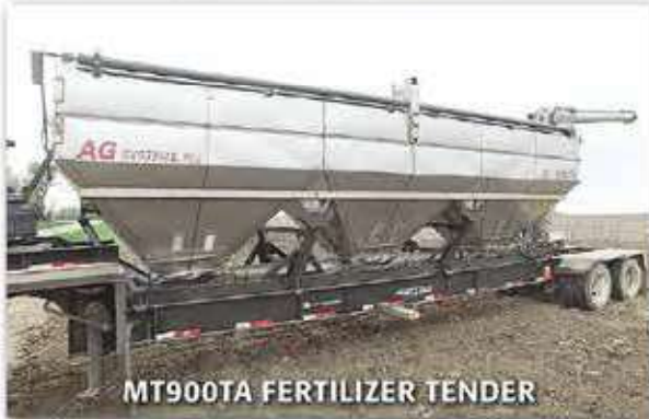
MT900TA FERTILIZER TENDER