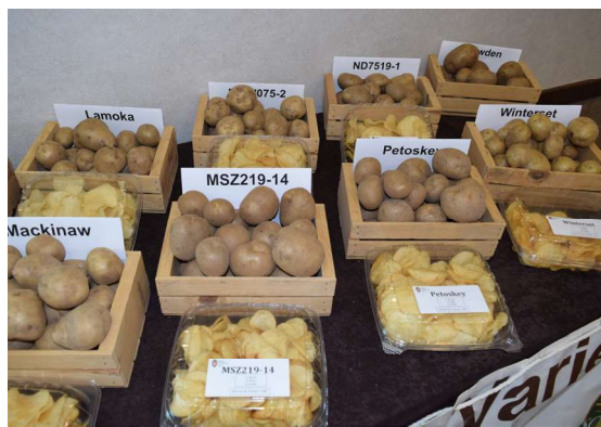
On display at the Grower Ed Conference & Industry Show were potatoes and chips from the UW-Madison Potato Variety & Advanced Selection Evaluation Trial.