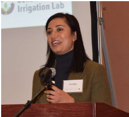
songs by Around Town after the awards ceremony.

Our sincere thanks to all sponsors who made the 2020 UW Extension & WPGA Grower Education Conference & Industry Show possible! For a list of sponsors, see the ad thanking them on page 71.