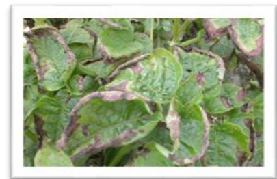
Hopperburn in potato

Both adults and nymphs feed by inserting their mouth parts into the plant's vascular tissue and extracting sap. Damage results when the insect injects saliva containing toxic substances which creates physical damage during feeding, plugging the vascular tissue and permanently reducing the plant's photosynthetic efficiency. The first signs of leafhopper feeding are the leaf veins turning pale and the leaf curling. Continued feeding results in a characteristic triangular yellowing or browning of the leaf tip known as "hopperburn". As symptoms develop, lesions spread backward and inward from the margin, eventually destroying the entire leaf. Plants become stunted and yellow leaves curl upward. Premature death of the plant may occur in severe infestations. Severe leaf damage and premature plant death is common in potato, whereas leaf discoloration and curling are more characteristic on bean.