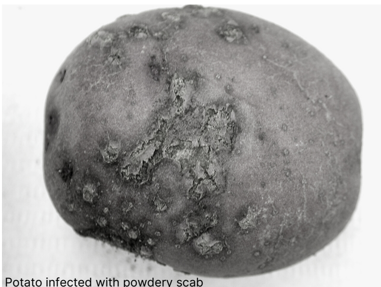
Potato infected with powdery scab