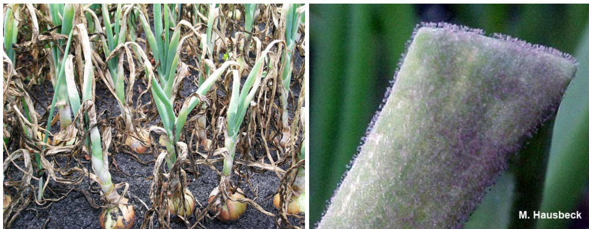
Above: Onion downy mildew in the field, left, and close up showing pathogen growth with fuzzy, gray spore masses.

https://cdn.shopify.com/s/files/1/0145/8808/4272/files/A3422-2021.pdf