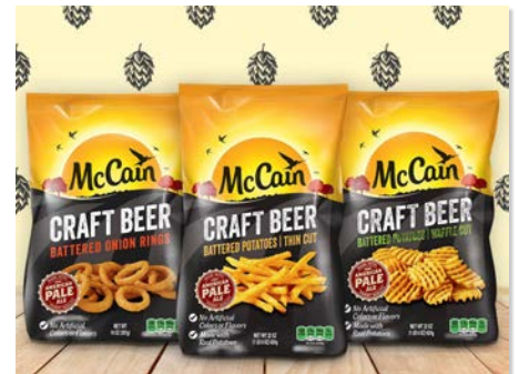
Among McCain Foods' many potato and appetizer offerings are Seasoned Curly Fries; Tasti Taters tater tots; Craft Beer Battered Onion Rings and Thin Cut and Waffle Cut Potatoes/ fries; Smiles; Shredded Hash Browns; and Seasoned Waffle Fries.