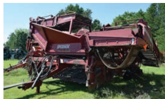
SPUDNIK 6400 4-Row Harvester/Tub Digger with Roller Table, 36-Inch, Field Ready!