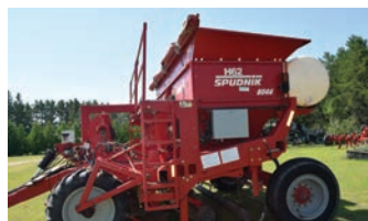
SPUDNIK 8046 7-row Potato Bed Planter Includes Fertilizer Tanks and Tubing