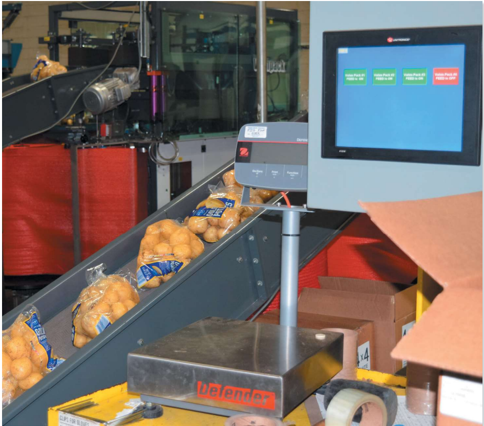
By adding automation equipment, Gumz Farms can get more done without adding people or hours.

"We feel we have been given an opportunity and have been fortunate enough to work with great people," he concludes, "from suppliers to customers to employees." BCT