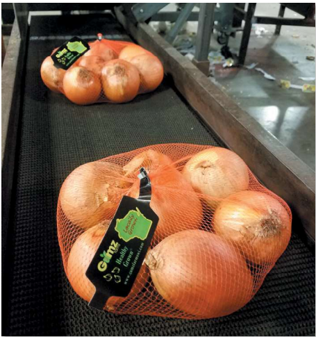
Above: In addition to growing and packing over 1,200 acres of Healthy Grown potatoes, Gumz Farms raises 40% of Wisconsin's yellow onions and is the largest producer of onions and red and yellow potatoes in the state.

"We feel that if we stop growing, we will go backwards," Rod says. "It's important to continue to make investments in buildings, equipment, technology, and people."