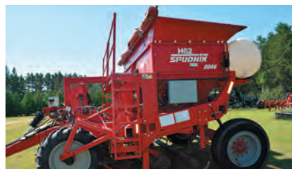
Used - SPUDNIK 8046 7-Row Potato Bed Planter. Includes Fertilizer Tanks and Tubing.