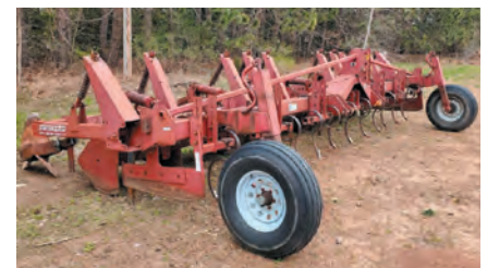
Used - 2004 SPUDNIK 9060 Hiller