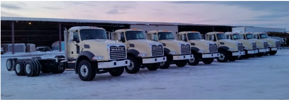
Above & Left: Kriete Truck Centers is one of the top five Mack truck dealers in the nation.