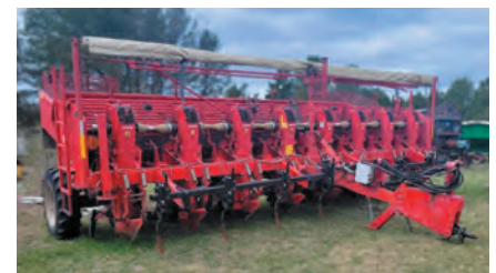
Used - 2009 GRIMME Model GL38T-2 8-Row Planter, 36" Row Spacing. 3 Available!

Proud Dealer of: New & Used Sales Service • Repair